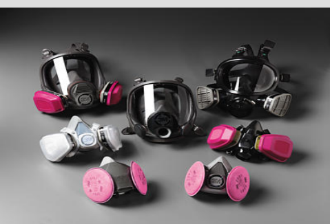
PERSONAL SAFETY ITEMS