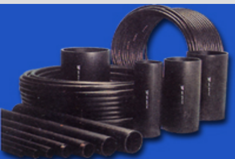
HDPE, PE, PVC PIPES