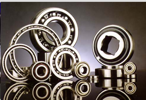
BEARINGS & ACCESSORIES