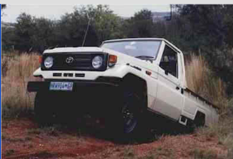
VEHICLES AND SPARES